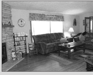
bring all offers! MLS 432695. Ask

Looking for a home in the country at a reasonable price that is move in ready? Well look no more! This home features an open floor plan, gas fireplace for cozy nights, built in jacuzzi tub, large detached garage, a spacious yard amongst mature shade trees and all on one main level! Call today for your per-